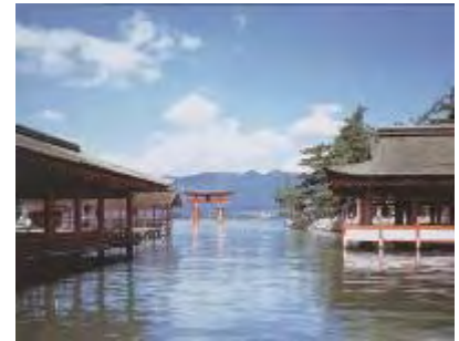
Floating shrine on sea water

People enjoy seeing the beautiful gorge covered with gorgeous maple tints in the fall and the primeval forests are kept untouched and preserved well. From the ancient times people have liked such a natural landscape of the sea and the forests that Miyajima is renowned as one of Japan's most beautiful trios along with Matsushima