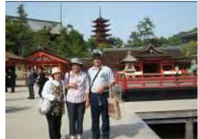
2009: Hiroshima club to Auckland North Shore, NZ