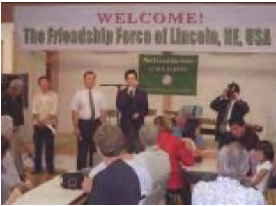
2004: Lincoln club, Nebraska to Hiroshima