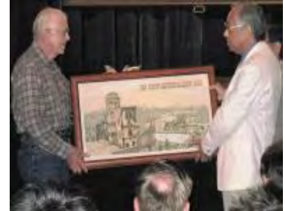
Presentation Embroidery Picture to Mr. Jimmy Carter

Bell of Hiroshima The temple bell once doomed to become weaponry is now exhibited in the Carter Center in Atlanta Georgia titled ‘The bell of Hiroshima’ symbol of peace. This was the beginning of friendship between Mr. Jimmy Carter and Kounu Town and eventually led to the Presidential visit to Kounu Town two times.