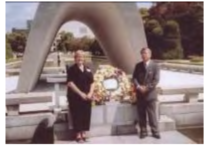
2006: Hiroshima club to Lincoln, Nebraska