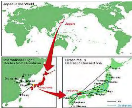
Access map from the World