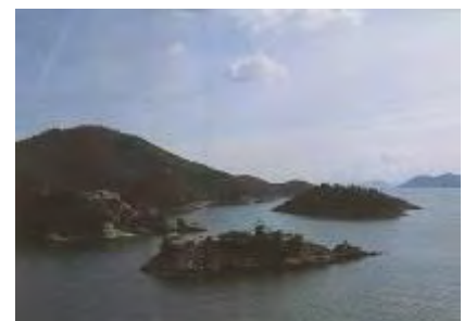
Sensuijima of Tomonoura

Representing the scenic spots in the Seto Inland Sea National Park is Tomonoura. The green islands floating in the nice and calm Seto Inland Sea are just as good as the ones out of the picture postcards. There remain lots of historical landmarks and relics in Tomonoura as an important port of call for the ships to stop