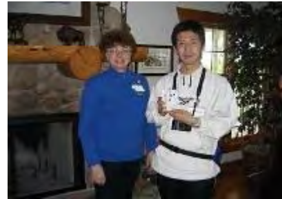
2008: Auckland & Rotorua club to Hiroshima